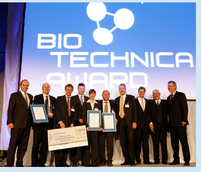
1. Renovo Group (UK), 2. Genmab A/S (DK) and 3. Bavarian Nordic A/S (DK)